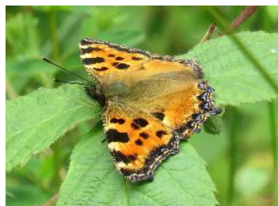
2020 - first sighting!