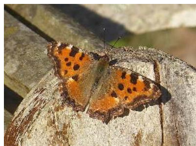
5th April 2025