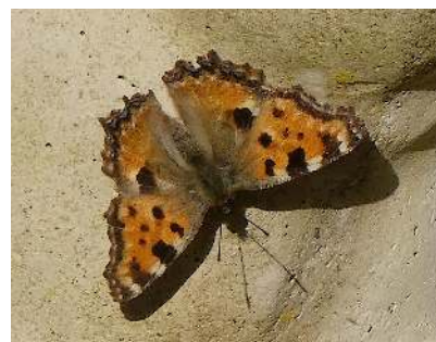
14th March 2026