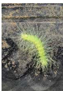
Miller moth