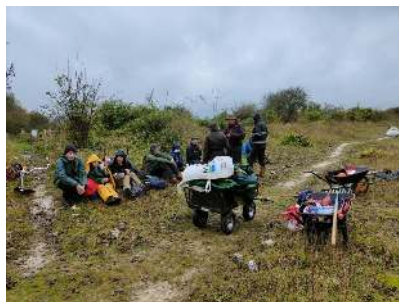
MHD - in all weathers!