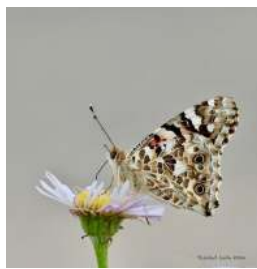
Painted Lady © Sheila Williams