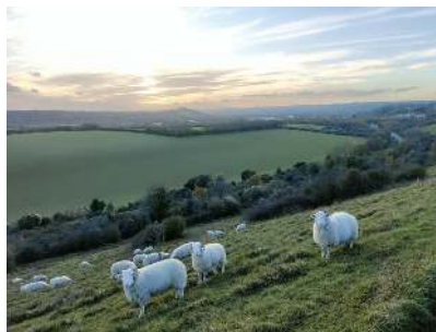
MHD - Ovine work party