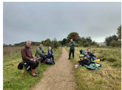
MHD - Monday volunteers