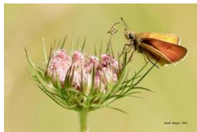
Small Skipper