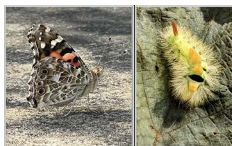
Painted Lady & Pale Tussock