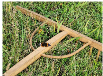
Yew Hill - a friendly Red Admiral