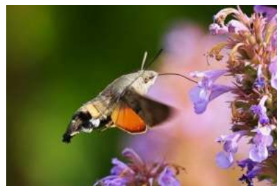
Hummingbird Hawk-moth