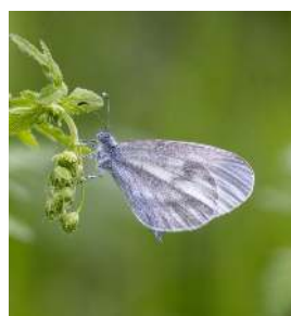
Wood White