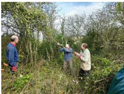
MHD - Clematis tug o' war