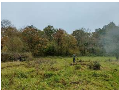
Bentley Station Meadow - work party