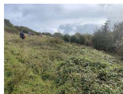
A few photos of recent activity at MHD. From L-R: Brush cutting in Area 4; The Mace volunteer team; Some precarious work in Area 4.