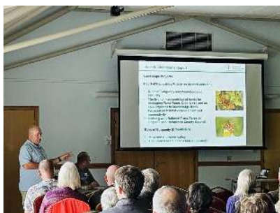
The chairman's annual report, in the morning session