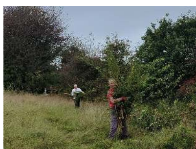
Scrub clearance (12 Oct)

Twenty little Shetland sheep finally returned to Yew Hill in November. They need to have big appetites as there is a lot of grass to get through! In hindsight, I should have asked for double the number. The volunteers have been clearing hawthorn scrub, freeing anthills, and cutting and raking the Southern Water meadow.