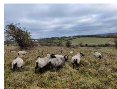
Shetland sheep (23 Nov)