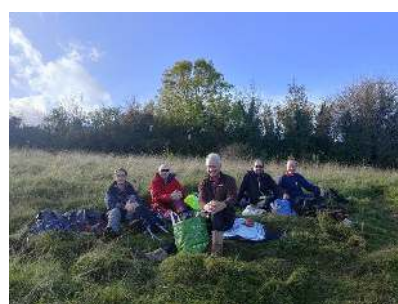
Volunteer team (9 Nov)