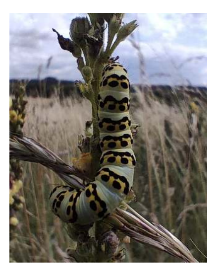
Striped Lychnis moth caterpillar at MHD