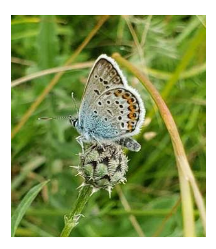
Rupert's indisputable Silver-studded Blue at Yew Hill

The Bentley Station Meadow volunteers had a workday, with another planned, to clear footpaths and start replacing the waymarker posts for the transect route.