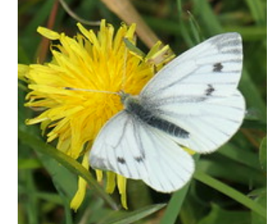
Green-veined White (Neil Smith)

Moths to spot: If you're very lucky you may catch sight of a female Muslin Moth. These tend to be on the wing in Hampshire during April and May and are seen in parts of the New Forest and along the Avon Valley. With a wingspan of about 40mm, the female is white, with slightly translucent wings. The males are duller grey in colour and only tend to fly at night. This is probably the last week the Orange Underwing is