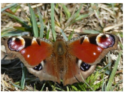
Peacock (Ron Taylor)

Twelve different species were seen this week, including Green-veined White and an early Clouded Yellow at Blashford. Full numbers were Brimstone (308), Peacock (142), Speckled Wood (137), Orange-tip (40), Comma (12), Small White (6), Red Admiral (6), Green-veined White (4), Large White (3), Holly Blue (2), Clouded Yellow (1) and Small Tortoiseshell (1).