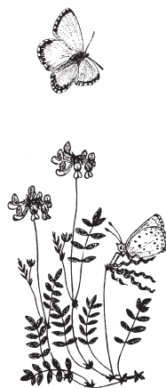
Horseshoe Vetch and Chalkhill Blues