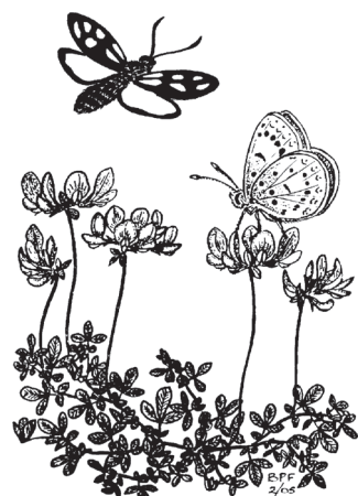
Six-spot Burnet Moth (left) and Common Blue (right)

A field to the east which had been intensively farmed for over fifty years was acquired. It is known as the Extension and in 1997 was sown with specially selected native wildflowers