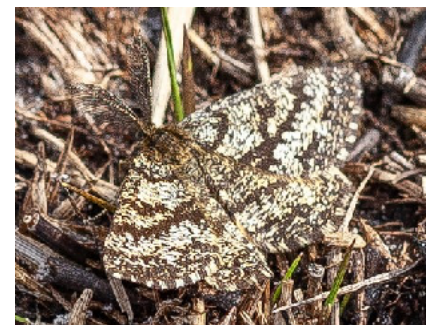
Common Heath John French

Moths to Spot: One of our top moths from last year, Common Heath , were first spotted in Week 4 and then seen almost continuously until about mid-June. About the size of a Silver-studded Blue butterfly, these little moths are quite variable in colour, from a warm yellowish brown through to light grey, with distinctive darker cross bands. Although seen most frequently flitting over heathland, they can also be found in woodland rides where they might rest on a blade of grass, with wings open. Remember that the Emperor Moth should also still be on the wing.